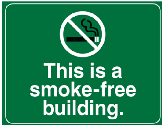
Sample sign from www.smokefreehousingny.org

Consider what assistance you can provide to PHAs and building managers. Providing technical assistance to PHAs and building managers can give them needed direction and confidence with moving forward on their policy. Can you help coordinate a meeting or give a presentation for PHA staff and building managers about preparing for implementation? Can you host a webinar about implementation and enforcement? Can you make smokefree signs available? Can you help managers conduct a survey of residents? Can you connect PHAs with cessation options for their residents?